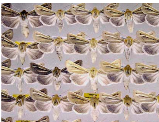
Figure 2. Color Range in Adult Sand Verbena Moth.

The Moth has exhibited a range of colors (Figure 2).