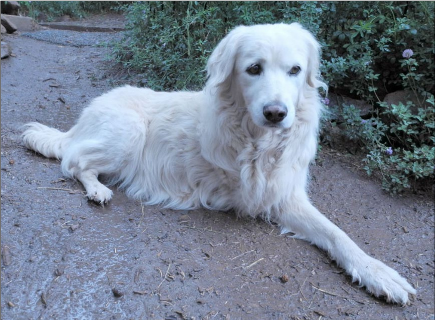
Dogs caught in traps commonly require amputation surgeries or other treatment for their injuries. Charles Fox

These professionals cited pain and stress, and harm to non-target species as the two primary reasons for