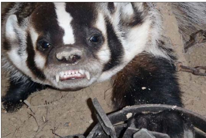
Nearly trapped to extinction in the past, the badger has rebounded in some parts of the West. State population data is lacking, however.

Prohibiting the use of indiscriminate traps will balance management with the expectations of the majority of the public and will help ensure public safety. It will also protect individuals from enduring the emotional and financial strain of dealing with the loss or injury of their companion animals to the jaws of a trap.