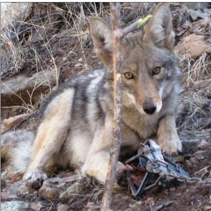
Trapped animals fight for their freedom and many sustain catastrophic injuries while ensnared.

Animal traps fall under two categories: restraining or killing. Restraining traps hold the animal until the trapper arrives to kill it. Kill traps are designed to cause immediate death and are used either terrestrially or underwater. The terrestrial traps snap the neck or