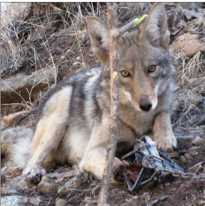
Trapped animals fight for their freedom and many sustain catastrophic injuries while ensnared.

Animal traps fall under two categories: restraining or killing. Restraining traps hold the animal until the trapper arrives to kill it. Kill traps are designed to cause immediate death and are used either terrestrially or underwater. The terrestrial traps snap the neck or