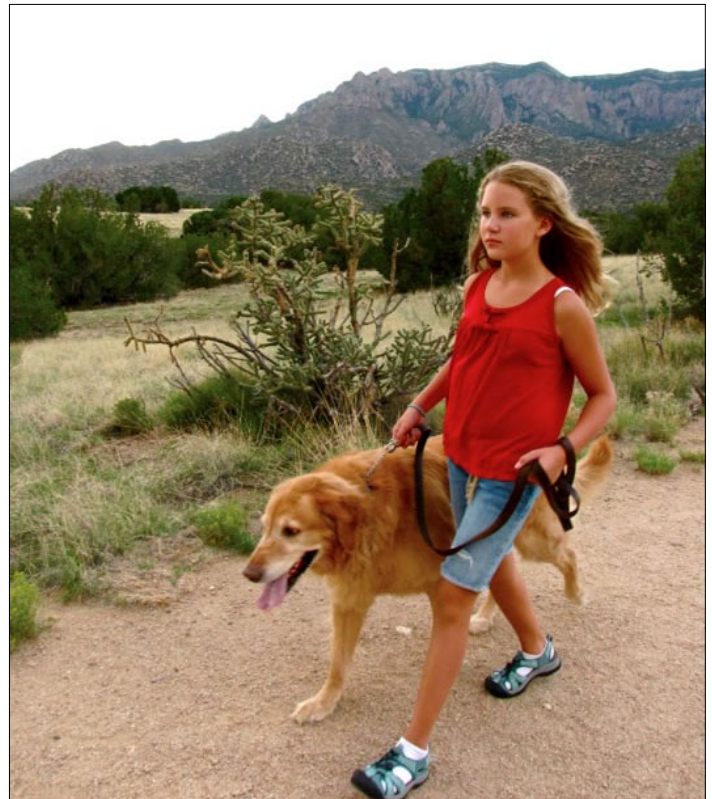
To save time, trappers may set traps close to trails, roads, and campgrounds, which can expose people and pets to dangerous traps. Cat Cannon

spine of captured animals. Traps do not discriminate between similar species and often catch non-target animals.