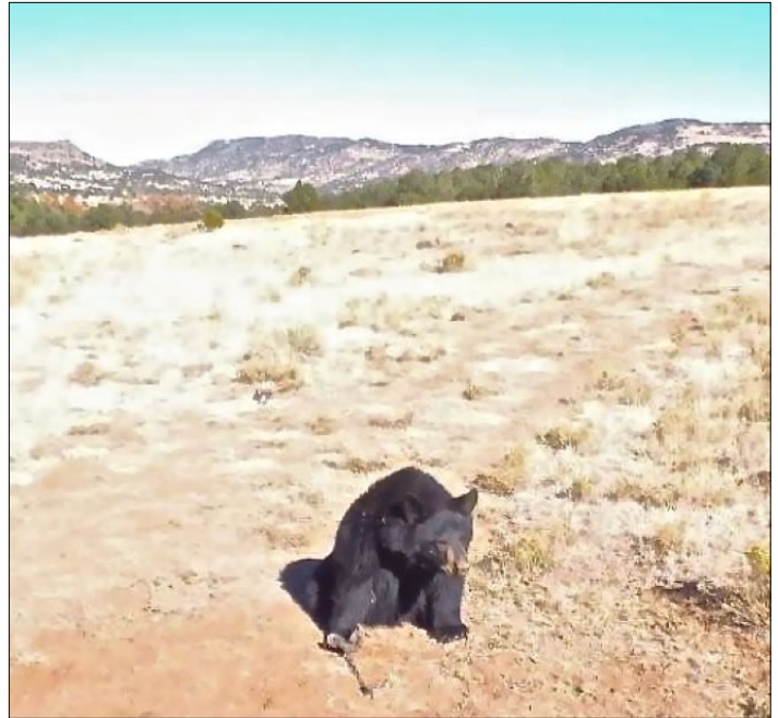
Many states do not permit bear trapping, but this black bear was incidentally trapped in New Mexico. Born Free USA/Respect for Animals